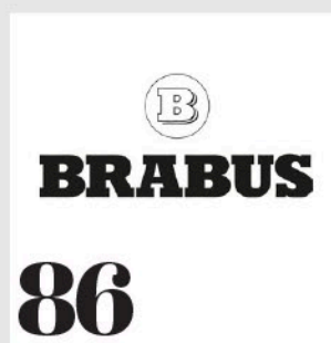
BRABUS ROLLS ROYCE